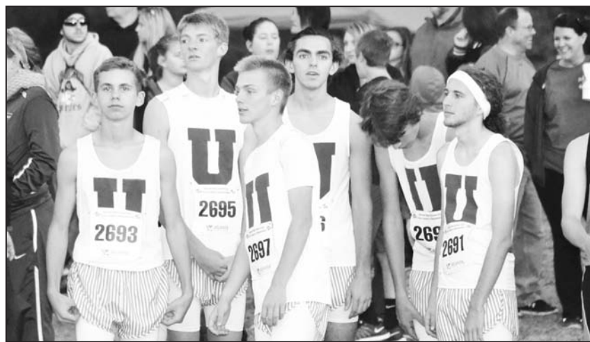
Left: The guys at the starting line in Carrollton on Saturday morning

Fifth place North Hall placed two runners in the top