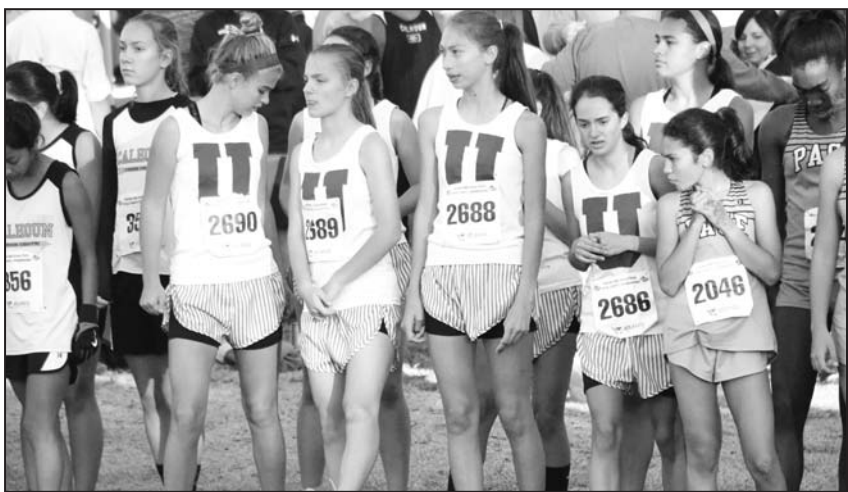
Right: The girls team waits patiently at the starting line to begin the State Championship race.